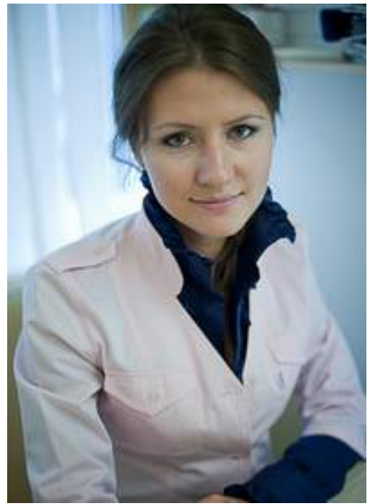
Gynecologist endocrinologist, diagnostics medical specialist.